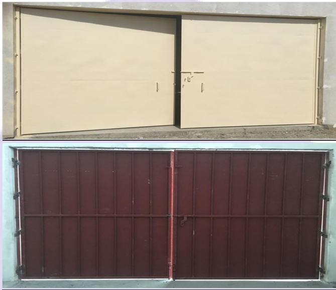
Steel Doors for Warehouse