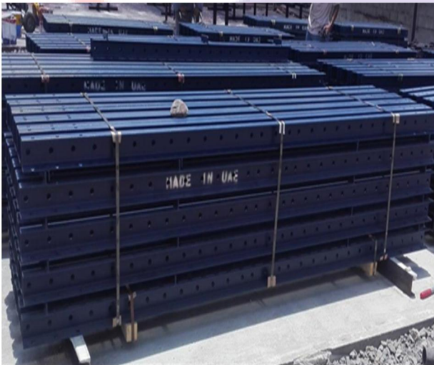
Multi Purpose Steel Waling